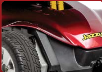
Easy-access freewheel levers