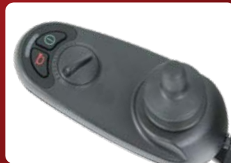
PG GC3 Controller

The sleek and elegant Jazzy® Elite ES-1 1 delivers high-class maneuvering with front-wheel drive technology. Enjoy effortless controls and a comfortable, high-back seat on this power chair. Choose Jazzy every time.