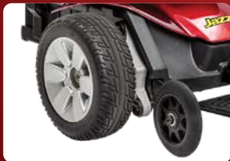
Front-wheel drive design