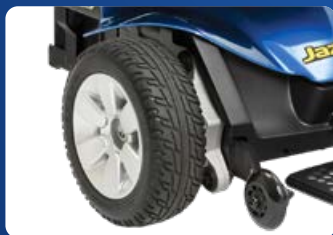
Front-wheel drive design