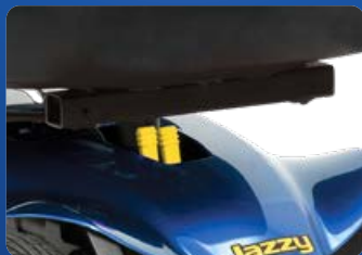
Easy-access freewheel levers