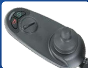
PG GC3 Controller

An experience so superior, it can only be elite. The Jazzy® Elite ES 1 features large, front-drive wheels to absorb the bumps and uneven surfaces of everyday life. The comfortable, high-back seat gives you the support you need all day, every day.